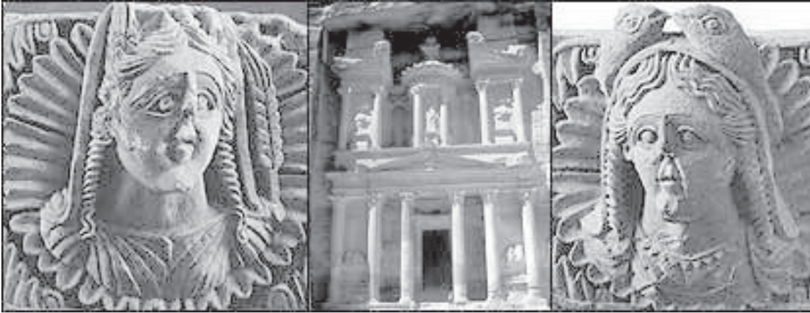
AvBq`vtg Rvtnuj qvtZi gvb| .uj eü i Kg gwZP cRv tKvi tZv|

AVR miv `bqvqg tgvmtjg RwiZi Pig `yRv| Ab` me RwiZ ðviv Zviv civiRZ, AcgwbZ, wbhWZZ| Aciv tK `bqv`vcx Ab`vq AwPvi, `bWZ, tK`j, nrvnwb, hç, i`cvtZi Awak` cW`exi meRvtji tiKW`F½ tKvti tQ| imj vjvni (mv.) AvMgb cefci hM tK AvBq`vtg Rvtnuj qvtZi ev AUKvti i hM evj nZ| KviY ZLb cW`exi tKv`vl Gmjvg wQj bv| AvR 160 tKwU tgvmtjg Gmjvtgi Abmvix nevi `we`vi, 55 w t`tk Zviv mSLvNmö| A_P eZGvb cW`ex AvBq`vtg Rvtnuj qvtZi tPtqI AUKvti wbgWZ| Gi KviY tgvmtjg bvgavix eZGvtbi GB RbmsL`vW Avjvni Aw`ZtK, Zvi GKZtK Aweklm bv tKvi tJ I Avjvni mveFfSgZ; A` tKvi tKvti `v`vvtj i A`R BÜw`- wL`-vb mF`Zvi, th mF`Zvi mveFfSgZ; Avjvni bq, gvb|I, Zv tgb wbtq Zvi AvbMZ` tKvi tQ| WK GB Ae`v wQjv Avitei gvb|I tPSti kÖ eÖi AvtM hLb Avjvni Zvi imj tK tmLvtb cWvtj b| ZLbKvi H Avieiv Avjvni Aw`zi I GKtZ; tZgub weklym tKvi Z thgb AvR Avgiv tKvi; wZb th mÖv, cÖZcvj K, me wQj wbgvqK, wZb th meRw`gvb G me wQÖB Zviv weklym tKvi Z (tKvib- miv hLi`d, AvqvZ 9; miv AvbKveZ, AvqvZ 61 I 63; miv tjvKgvb, AvqvZ 25)| Zviv GeivnxtK (Avt) Avjvni bex textj weklym tKvi Z; wbtRt i wjv wZ Geivnxtg textj weklym tKvi Z; Geivnxtg (Avt) ðviv cpbWZ KvefK Avjvni Ni textj weklym tKvi Z; Kvevi w tK gL tKvti Geivnxtgi (Avt) tK Lvtb c`wZtZ mijv in (bigih) Kvtqg tKvi Z; KvefK