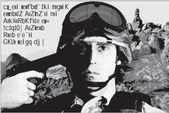
cw_extZ wbt"Q| tki mvgwi K ewnbxZ AvZhnZ v vi AvkVvRbKfite epv tctiq| AvZhnxb Rxeb e"vi GKUv weiq dj |

tefQ wbt"Q| WPS+ tKvi"b wK fgen! GK_v wbDqb -fKvi tKvi teb th, cw_extZ mefPtq AMOni, tPSKm l `q tmbvewnbx Bmi vBj l Avtgm Kvi, Zvt i cOZwU m"m e"v M Z f v t e AKi b x q m f h m m j e a v t f v M t K v i _ v t K b | evKx `y b q v i m v a v Y g v b l , t m b v e w n b x i m " m i v G g b w K