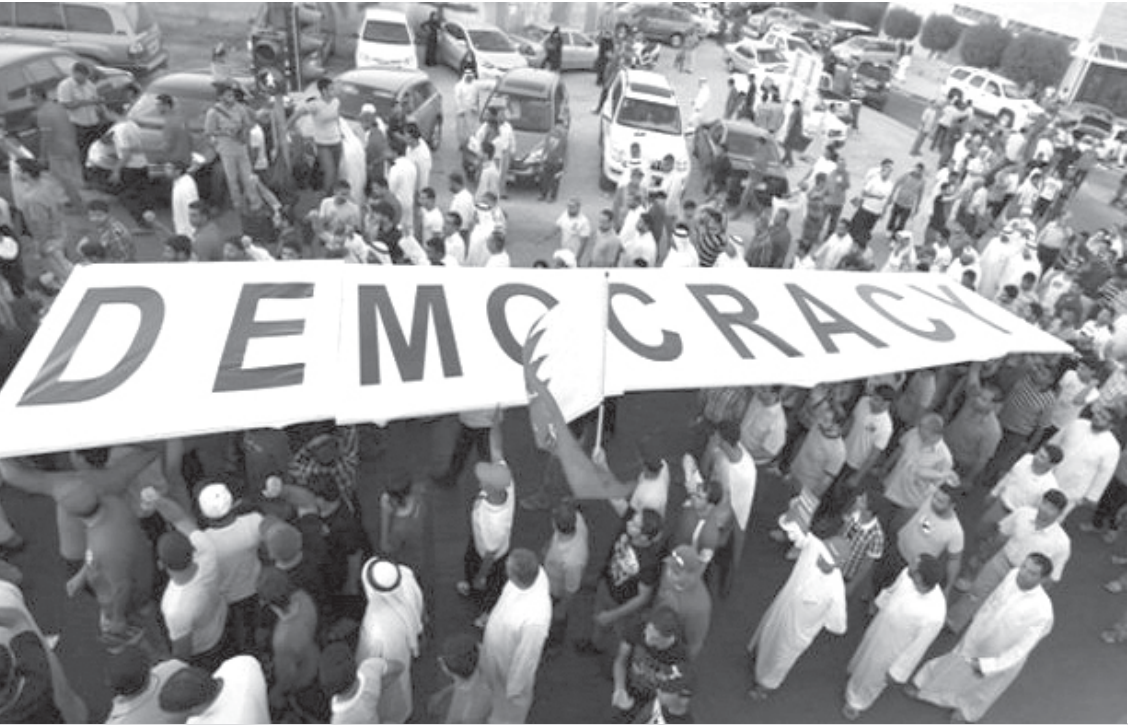
eZgvtbi tgmjtj gmn mKtj cRv tKvi tQ Kw cv tii gwZP e` tj MYZSi mgvRZSpjn gvbepi PZ wevfbcZSi; gtsj |

tKvK t` tK gw 3 , e` emv-ewytR` mvdj, tKvb wec` t` tK D`vi BZ`w | G K`vi cdyY GB th, `qs Avj vn tevj tQb- Zviv Avj vn e` ZxZ hvi Ger` Z Kti Zv Zvt` i tQvZi tKvi tZ cvti bv, DcKvi I tKvi tZ cvti bv | Zviv etj, tQb` wj Avj vni vbKU Avgvt` i mpcwii kKvi x0 (tKvi vb- miv BDbjn, AvqvZ 18) | β) Zviv wekjm tKvi Z th thnZyH gwZ` wj, H t` e` t` ex` wj Avj vni Nvb0 I wecbi KvtRB Zvt` i cRv tKvti Zvt` i mšo tKvi tZ cvtj Zviv cRvix` i Avj vni mwb0 (Ki weqv0) Gtb t` t`el G` e` cvt` i Avj vn tevj tQb- hriv Avj vni cwi etj Z` Ab` tK Awf` fveKifc MhY Kti Zviv etj, tQvgiv tZv Gt` i cRv G Rb` B tKwi th, Giv Avgvt` i tK Avj vni mwb0ta` Gtb w` t`el (tKvi tQv- miv hgv, AvqvZ 3) | t` Lv hv` Q- Avie tgvkti Kt` i gwZ` Rvi t` cQtb ` tUv D` t` k` w0tj v, GKwU ` vbqv` vix, Ab` wU Avt` LivZ | H gwZ` wj tK Avitei tgvkti Kiv KLbB Avj vni ` vtb emvq` bvB | Zvt` nvtj ckef` nvt` Q- AvR tgmjtj g tevtj cwi PZ GB RbmsL` wU (tKvb D` s` n ba) th ` vbUvK cvj b tKvti vb tRi` i tgv0tgb, tgmjtj g I D` s` Z tgvnv` s` x tevtj wekjm Kti Ges gZ` j ci Rvb0Z hvi Avkv Kti H RbmsL` wU Ges Avitei H tgvkti Kt` i RwiZwU hvi gta` Zvt` i tn` vqvni Rb` Avj vn Zui imj t` c0Y tKvi tjb G ` tUvi gta` c0f` tKv` vq? K` vUv Avil cwi` vi tKvi tQv eZgvtbi GB ` vb cvPwU tivKtbi ( ` s` ) I ci ` w0tq AvtQ, G K` vq tKvb m` n AvtQ wK? Aek` B ba; Ges tm` wj tnvtj v- 1) Ktj gv, 2) miv vn (bvgh), 3) hvKvn, 4) nR; 5) mlg (tivhv) | hviv G` wj i lci wekjm ` vcb tKvti I` wj cvj b Ktib