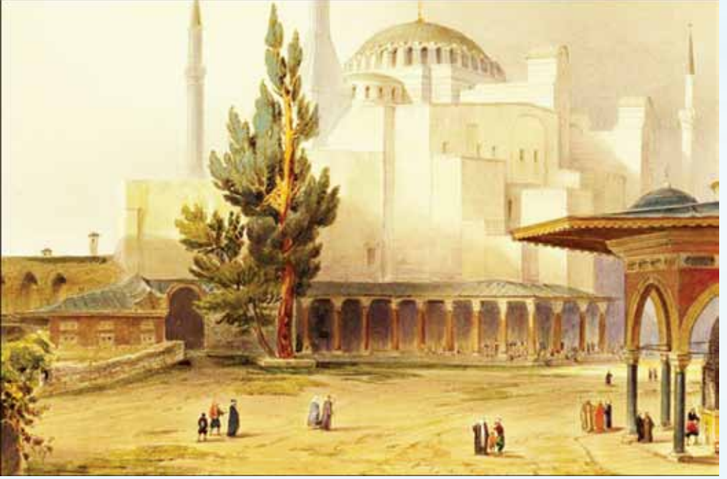
ৱকি xi Zuj tZ Gmj vgx mf'Zvi AŞfP 14k kZtKi GKuJ ZK®AwZw_kuj v l Zrmsj MenvmcvZij thLvrb AwZw_t i_vKv, Lvl qv l wPwKrmv tnvZ m=úYwébvgtj 'N GB Ae'v wKS'cKZ Gmj vg nmi tq hv qvi KtqKk eQi cti i NUBv|

Administration. Kbt'f'Ui Ktc cwb wbw' 0 wQj tmLvbKvi Awaemxt' i e'enrtii Rb', miKwii tjvtKt' i tNvovi Rb' bq| ZvB hLb tNvovt' i tK tmB cwb Lvl qv'bv tnvj tmUv wQj GKuJ Ab'vq KvR| ZvB H cwb cvb Kivi cti tNvov wj Amy' tnvrtq cto| G msev' tkvvi m½ m½ g'vi Avgxi l eStZ cwt' b th Zvi cZubwaiv wK fj tKvt'tQ| wZwb m½ m½ QfU Avtmb Ges Kbt'f'Ui Awaemxt' i KvTQ 'lgv c0'bv Ktib| Zviv hLb tNvov wj i tctU nvZ ewj tq t' b tm wj i tCU t_K H cwb tei tnvrtq hvq Ges Zviv my' tnvrtq hvq| gj Zt Guv wQj Avgxtii cZubwaiv i Rb' GKuJ eo wK'Yxq weLq| tmUv tnvrt'Q: Kvi wK AwaKvi ev nK Zv Avj vn KZR wbw' 0 Kivi ci tKD hw' tmB nK bó Kfi Zvi dj ZvtK Aek'B tcvntZ nte, Ab'ivl GRb' 'qwi Zi wKkvi nte| thgb Zviv Kbt'f'U Awaemxt' i AwaKvi f'P cwb i Ace'enrtii Kvit'Y wKQy'wiciva c0Yx Kó t'cj | G kwšsgq my' i mgvR Avgiv nmi tqwQ| Avi wewbgtq hv tct'qiw Zv tnvj :- Avj vni mZ' xbt'K c0'vL'vb tKvti AvRtK Avgiv v'4vtj i 'Zwi gZev' MYZŠ; mgvRZŠ; GKbvqKZŠ; BZ w' M0Y tKvti wbt'qiw| cket'nvj Avgiv wKtmi wewbgtq wK tct'qiw? GBme ZŠgtŠj Mj fiv ewj AvtQ wKS' Zv Abvrvix gvbt' i tct'Ui 'lav tgUvtZ cvitQ bv| c0Zw' b c0g GK wewj qb gvbl bv tLtq AvtQ| GB ZŠgtŠj c0E gvbewaKvi mb' AwZ gvbeK, wKS' ev 'te t'wL c_w'exi tKwU tKwU tgvmtj'g bvgavix gvbl Mpnviv, Zvt' i Rxe'tbi tKvb gj' tbB, Zvt' i tqtq't i