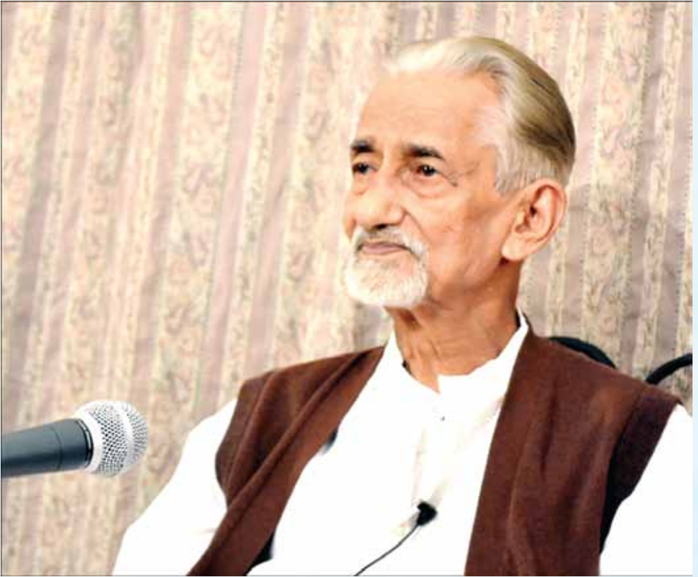
G hvgvbi Ggvg, Gvgghhvgvb Rbve tgvnvঃঃ eqvRx` Lvb cbæ