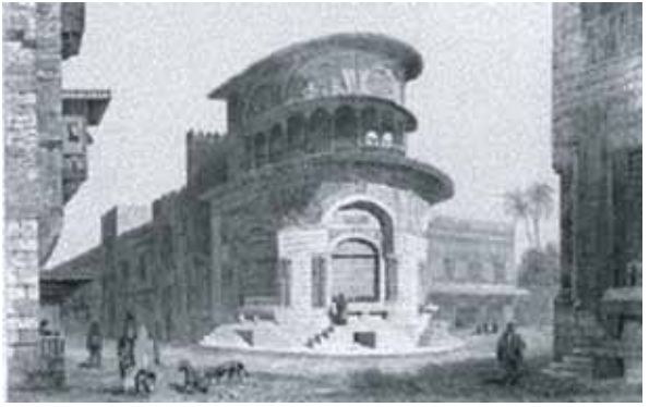
wgk±i i GK±U± c±P±xb Av±Z±w±k±v±j±v±

th mg±qi K_v tevj wQ ZLb cKZ Gmj vg wQj bv| cKZ Gmj vg nwi±tg tMtQ imj vj vni `w±q± t±K we`vq Mt±Yi 60/70 eQi ctiB hLb D±stZ tg±v±±x Avj vni `xb cZ±v±i msMtg Z`m tKv±tQ| Avgiv tevj wQ 14k0 kZ±Ki K_v| tg±mt±g RwiZi c±tqi w±tP ZLb A±aR `w±q± A±Xj m±ú±i DEiwaKvi t±v±g GB RwiZiU±i kv±tKiv Ab`vb` ivRv ev`kv±i gZB t±v±w±v±tm gE| Z±e Zv±v tg±mt±g wQ±t±b G K_v Ab`Kv±h± KviY Aa`c±w± exi mve±f±sg±Zi ZLb| Avj vni, t±mLv±b AvBb-Kv±b±, A`Bw±Z, `E±v±a A`±R Riebe`e`v ZLb| Avj vni| GB `x±bi c±f±te t±mB m±v±R c±Z±w±Z wQj AKi±b±q± kw±st± m±g±v±R t±tK Ab`v±q Akw±s± Aciva c±q± w±g±g± t±v±q± w±t±q±wQj| g±v±t±i Rie±b± l± m±ú±i i± w±v±c±E±v± wQj P±v±s±, g±t±mi ci g±v± Av`v±t±Z Aciva ms±v±s±-t±Kiv g±g±v± Av±mt±Z±v± bv| g±v±t± hv±Kv±Z l± m±Kvi A`±w±t±q± c±t± c±t± N±j±t±Z±v± k±s± M±v±y Kivi g±Z t±Kv±b `w±i`±g±v±t± L±R± t±c±Z± bv| GKRb h±e±x± v±v±x± Aj±v±i c±w±i±v±Z Ae`v±q± m±ú±i±G±Kv± k±Z± k±Z± g±v±t±j±i c±w±m±w±t±Z c±v±t±Z±v±, Z±v±i g±t±b± t±Kv±b±f±c± ±q±±±v±Zi Avk±v±l± R±v±M±Z± t±v±Z± bv| G±g± G±K±U± m±g±t±g± c±w±i±e±R±K± Be±t±b± e±Z±v± tg±mt±g± m±f±Z±v±i c±Z±w± kni c±w±i±á±y± K±t±i±b±| Z±v±i± t±j±L±v± t±t±K± t±m± mg±t±qi G±K±U± m±y±ú±o± w±t± c±w±i±U±L± t±v±q± l±v±l±